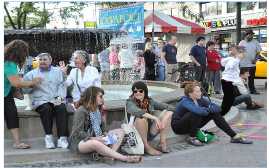
A Tuesday at the Triangle evening